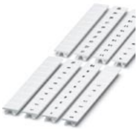
Zack marker strip, 10-section, horizontally labeled with the consecutive numbers: 11 ... 20, white, width: 8 mm

Please be informed that the data shown in this PDF Document is generated from our Online Catalog. Please find the complete data in the user's documentation. Our General Terms of Use for Downloads are valid ( http://phoenixcontact.com/download )